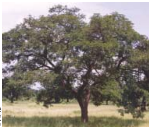
African locust bean tree

A link between the reproductive phase and leaf phenology has been observed. Leaves fall rapidly as increasing numbers of flowers appear and flushes of new foliage develop after flowering passes its peak. Flowering occurs near the end of the dry season, which lasts from December to April in West Africa, beginning later with increasing lati-