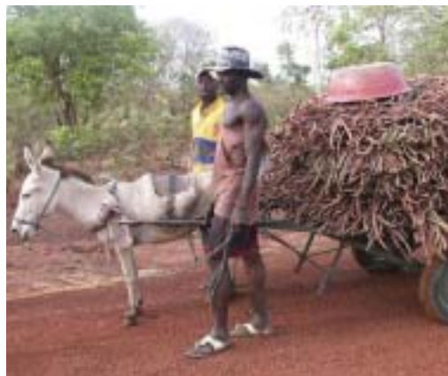
Collecting and transporting African locust bean pods in Burkina Faso

The seeds are orthodox, which means that they can be kept in long-term storage at 0-5°C with 5% moisture content. Proper seed handling is very important, however, as seeds lose viability if the moisture content is allowed to increase above about 5%. Several seedbanks in sub-Saharan