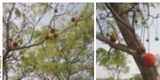
Different stages of flowering