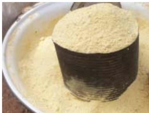
Afitin from Benin