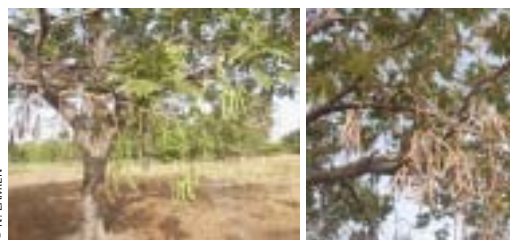
Different stages of fruiting