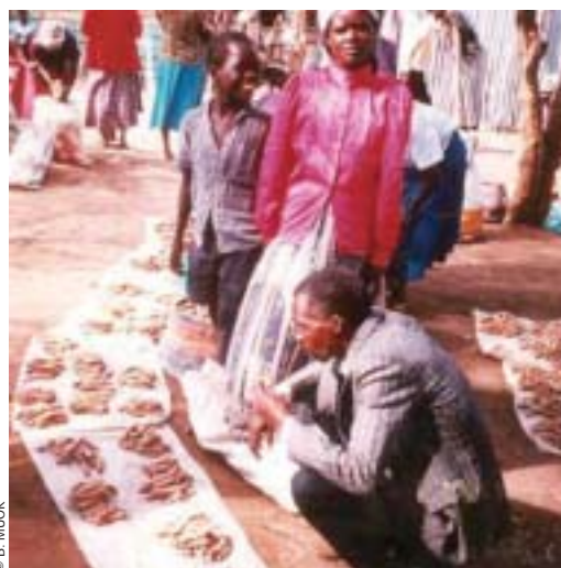
Retailers selling tamarind fruits in Eastern Kenya

Tamarind fruit and other products are sold on local markets in Africa as well as on international markets. Trade in tamarind products is an important source of income for farmers in Kenya. The fruits are also commonly marketed in