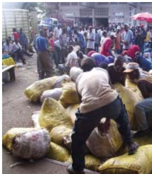
Trade of tamarind fruits in a local market

Karamoja, West Nile and Northern districts of Uganda, and children sell the fruit in Ethiopian towns and coastal towns in Kenya.