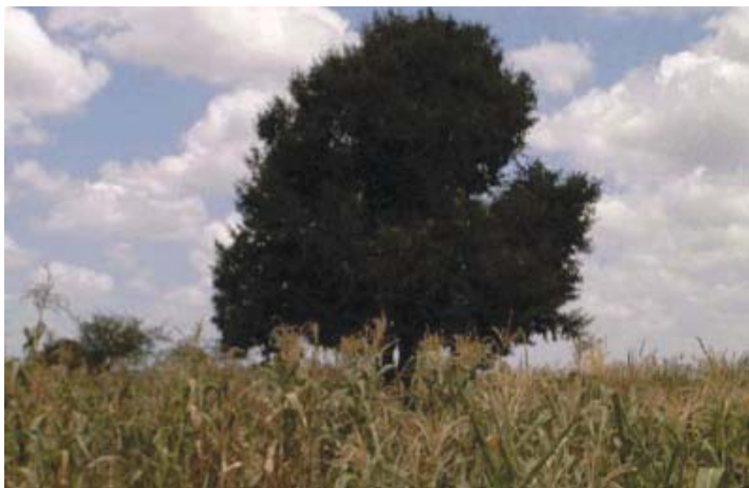
A tamarind tree left in cropland

Farmers select trees based on fruit taste and other important traits. Management of trees differs between those from which fruit is to be harvested for domestic consumption and those from which fruit is to be sold. For example, in the region of Ishiara, eastern Kenya, a particular tree with exceptionally sweet fruits was communally owned, such that all members of the community could harvest fruit for domestic