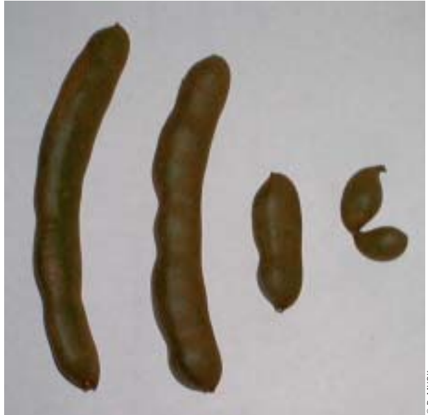
Differences in leaf and fruit size