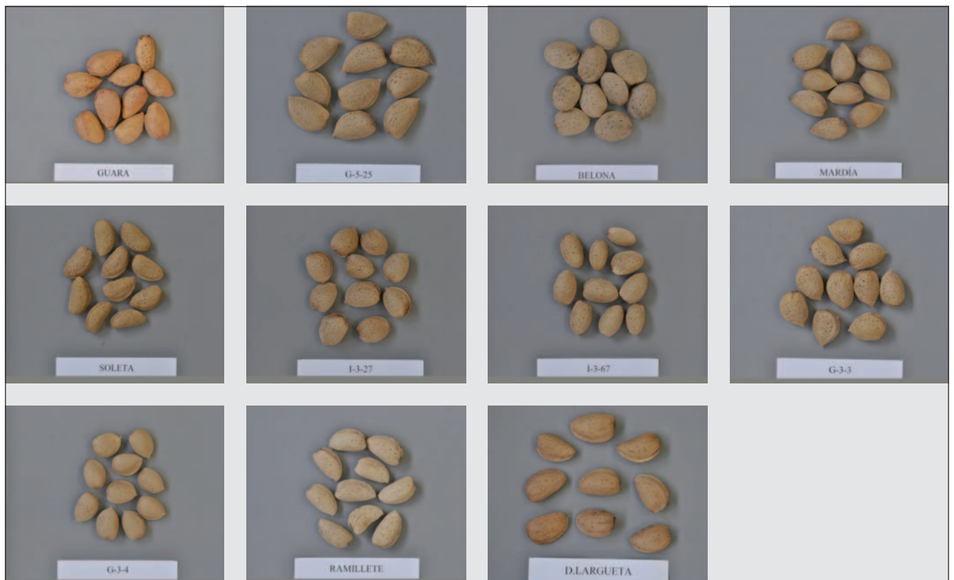
Almond cultivars and selections nuts.