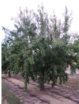
Fig. 3. Tree of ‘Vialfas’ in full production

Tree habit is slightly erect, although the crop weight slightly bends the branches (Fig. 3). Leaves show good tolerance to fungal diseases. Productivity in CITA trials and in experimental orchards in Caspe and Aniñón is very high.