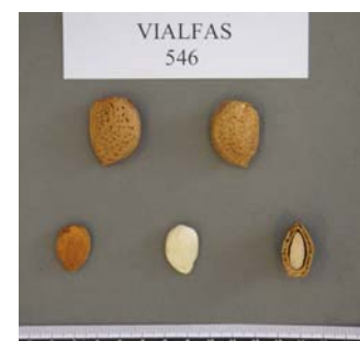
Fig. 2. Nuts and kernels of ‘Vialfas’