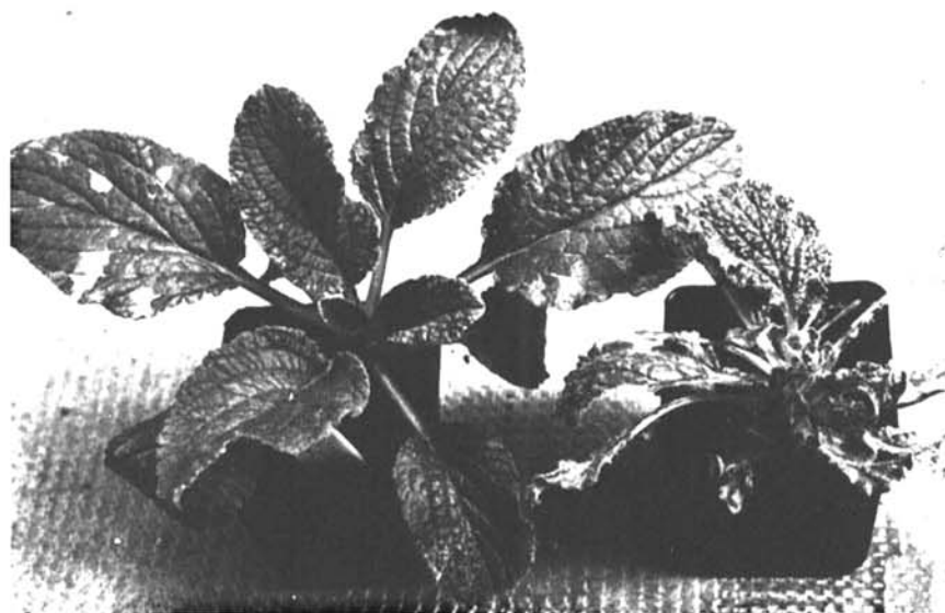
Fig. 1. Symptoms induced in Borago officinalis 2 mo after mechanical inoculation with sap from Cucurbita pepo inoculated with sap from field-infected borage. (Left) Healthy control and (right) inoculated plants.