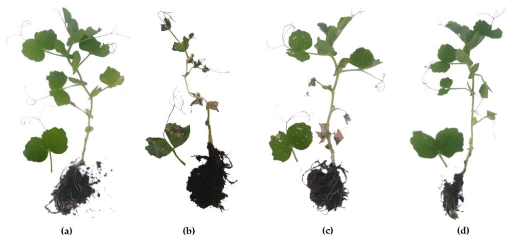
Figure 5. Symptoms of bacterial blight produced by P. syringae pv. pisi in plants of pea cv. “Lincoln” after 10 days of inoculation: (a) negative control; (b) positive control; (c) G. biloba leaf extract at 750 \mu\text{g}\cdot\text{mL}^{-1} ; and (d) G. biloba leaf extract at 1500 \mu\text{g}\cdot\text{mL}^{-1} .

Figure 5 shows the results obtained for pea plants cv. “Lincoln” treated with different concentrations of G. biloba leaf extract, particularly MIC and MIC \times 2 (i.e., 750 and 1500 \mu\text{g}\cdot\text{mL}^{-1} , respectively). The positive control showed a high susceptibility to bacterial blight, with an incidence of 100% of plants showing the characteristic brown and papery leaflet lesions. The plants treated with the extract at 750 \mu\text{g}\cdot\text{mL}^{-1} exhibited a relatively lower susceptibility, with an incidence of 60% (i.e., 6 plants out of the 10 tested showed symptoms, albeit with less virulence than that of the positive control). In order to provide full protection, the dose had to be increased up to 1500 \mu\text{g}\cdot\text{mL}^{-1} . As in the case of tomato plants, no phytotoxicity symptoms were observed, with no visual differences between the negative control and the MIC \times 2 treated plants.