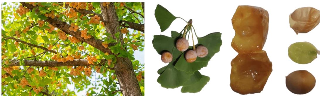
Figure 1. (left) Ginkgo biloba tree bearing ripe, fruit-like sarcotestae; (center) close-up of leaves and sarcotestae; (right) fleshy seedcoat (sarcotesta) and seed (sclerotesta).

be toxic; rather, the inner, softer portion of the seed (sclerotesta)—which has a greenish color—is eaten.