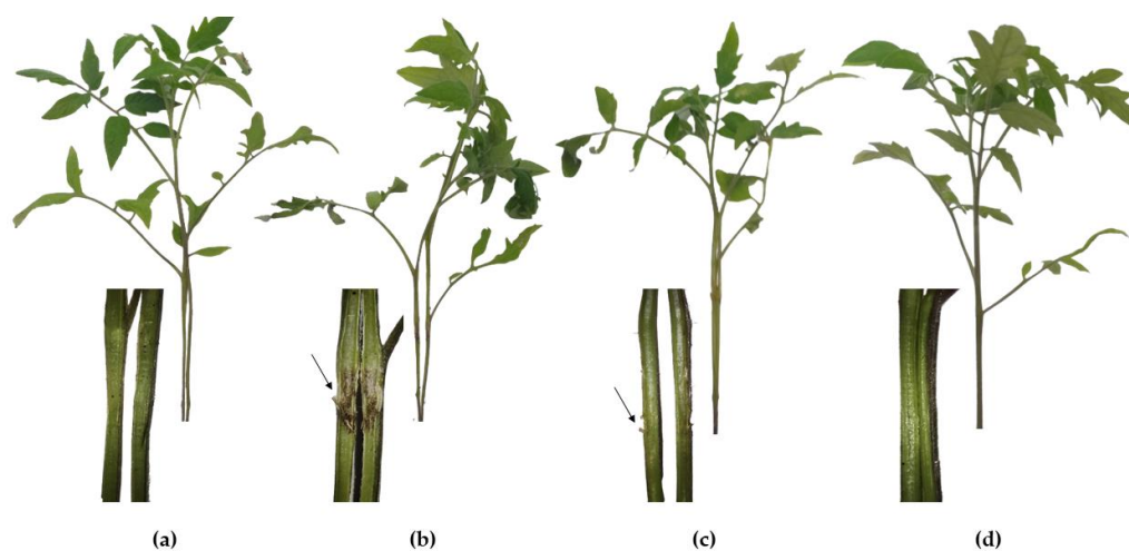
Figure 4. Symptoms of bacterial canker produced by C. michiganensis subsp. michiganensis in plants of tomato cv. “Optima F1” after 10 days of inoculation: (a) negative control; (b) positive control; (c) G. biloba leaf extract at 500 \mu\text{g}\cdot\text{mL}^{-1} ; and (d) G. biloba leaf extract at 1000 \mu\text{g}\cdot\text{mL}^{-1} .

Given that G. biloba leaf extract was the most active in the in vitro tests, it was further tested as a protective treatment against bacterial canker in tomato plants cv. “Optima F1” (Figure 4). In the positive control ( C. michiganensis subsp. michiganensis artificially inoculated on plants treated with bidistilled water only), all plants exhibited a typical vascular discoloration as brown streaks on the stem (Figure 4b). Plants treated with the extract at a concentration equal to the MIC ( 500 \mu\text{g}\cdot\text{mL}^{-1} ) showed an incidence of 80%, although the stem discoloration was less pronounced compared to the positive control. On the other hand, plants treated with the highest concentration (twice the MIC, i.e., 1000 \mu\text{g}\cdot\text{mL}^{-1} ) did not show symptoms of stem decay or phytotoxicity, appearing entirely similar to those of the negative control.