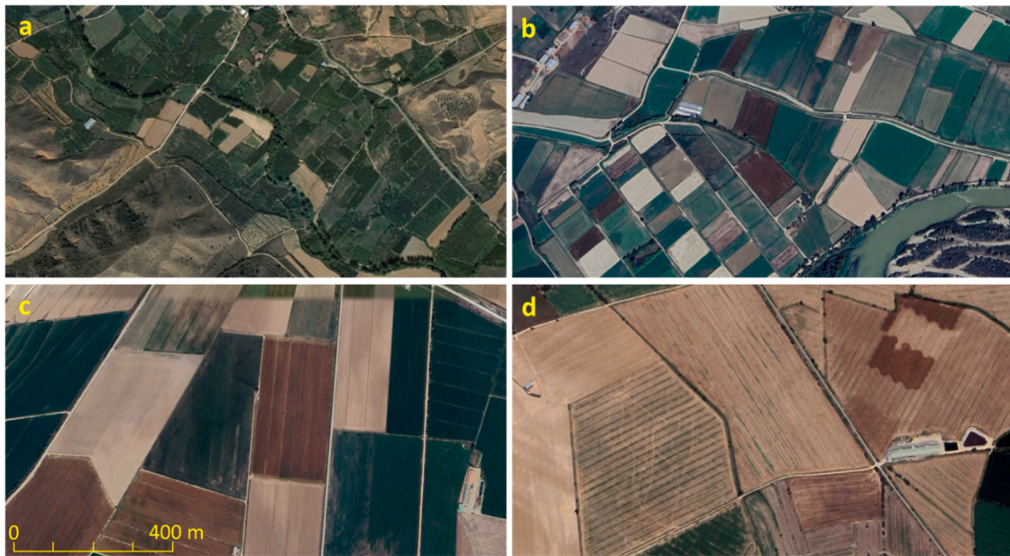
Fig. 3. Aerial photographs obtained from Google Earth, characteristic of different Irrigation Cartographic Units (ICU) classification categories in the Ebro-Aragón. All photographs are displayed in the same scale. The photographs represent: a) an RDT ICU near Villalengua (Zaragoza) in 2018; b) an RDS ICU near Villafranca de Ebro (Zaragoza) in 2023; c) an IDN ICU near Santa Anastasia (Zaragoza) in 2022; and d) an IPG ICU near Castejón del Puente (Huesca) in 2023.

very high discharges, making irrigation fast and rendering its automation cost-effective. In the case of pressurized irrigation, Almudévar is also a successful, digitalized model to explore in future M1 IDN modernizations and in future M3 IPE and IPG modernizations.