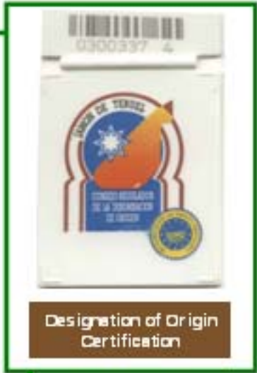
Designation of Origin Certification