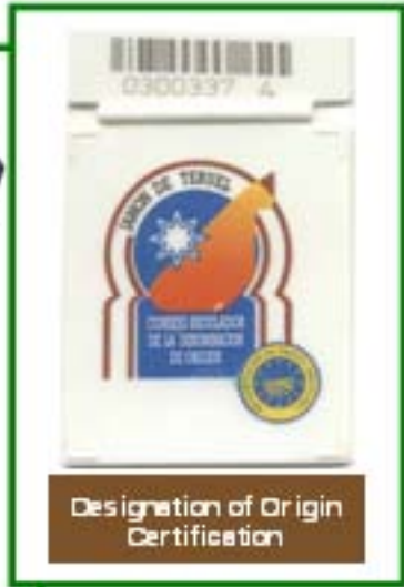
Designation of Origin Certification

Ingredients: Pork ham, salt, sugar, preservatives (E-252, E-250) and antioxidant (E-301)