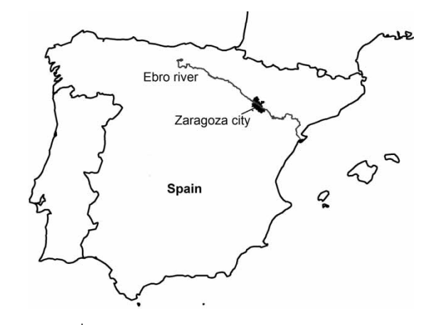
Figure 1 | Location of the city of Zaragoza.

The service of drinking water supply, sanitation and wastewater treatment in Zaragoza is managed by its City Council. As usual in Spain, the water consumed by the users is controlled by individual meters and taxed by a tariff system approved by the City Council. The water tariff system in Zaragoza in 2012 consists of a binomial system which combines a fixed charge based on the supply pipe size and a variable volumetric charge based on the volume